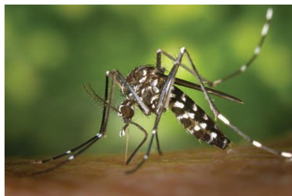
Figure 2 Asian Tiger Mosquito, Aedes albopictus