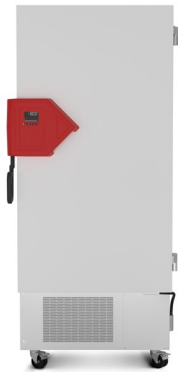
Model UFV 500 Sizes 17, 25 cu.ft.

Series UFV | Ultra low temperature freezers with climate-neutral refrigerants