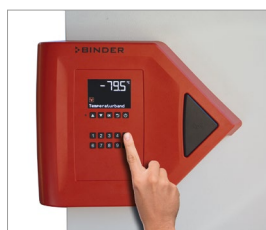
Door access system