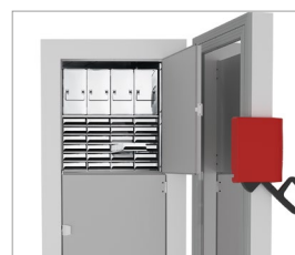
Selection of racks and boxes